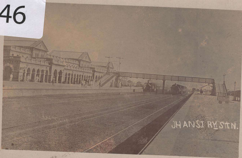
JHANSI RY STN.