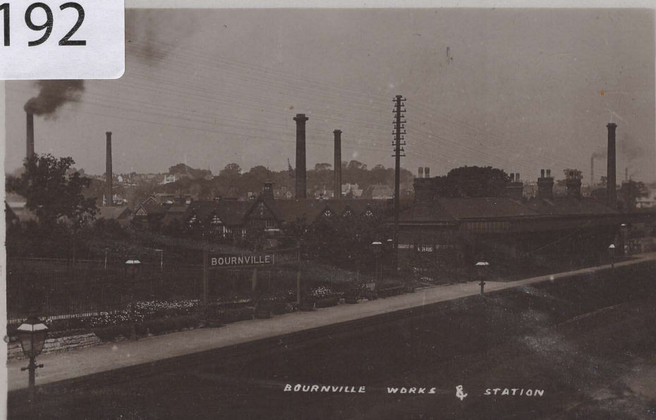
BOURNVILLE WORKS & STATION